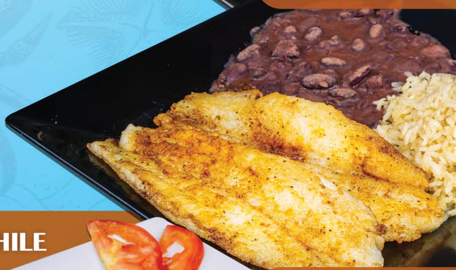
PESCADO A LA PLANCHA