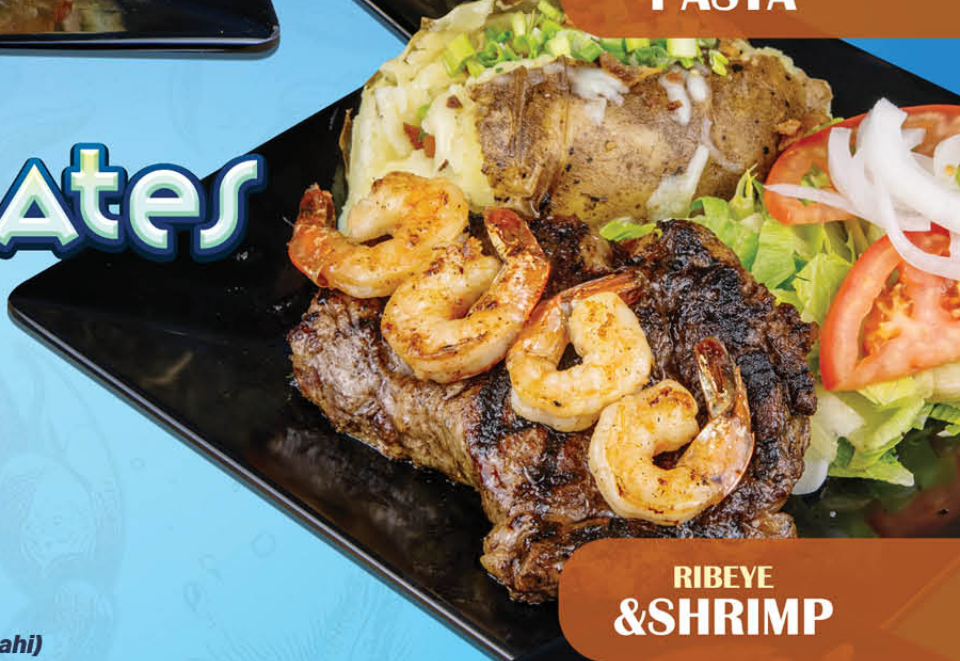
RIBEYE & SHRIMP

8 Tail-on gulf shrimp served with cocktail sauce $13.99