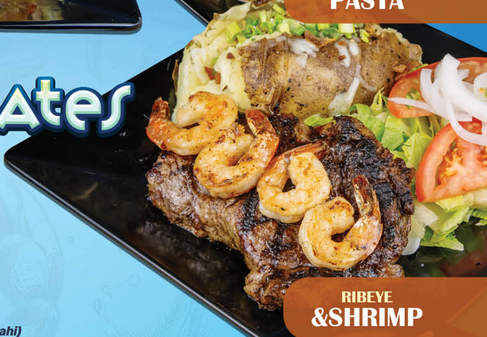
RIBEYE & SHRIMP

8 Tail-on gulf shrimp served with cocktail sauce $13.99