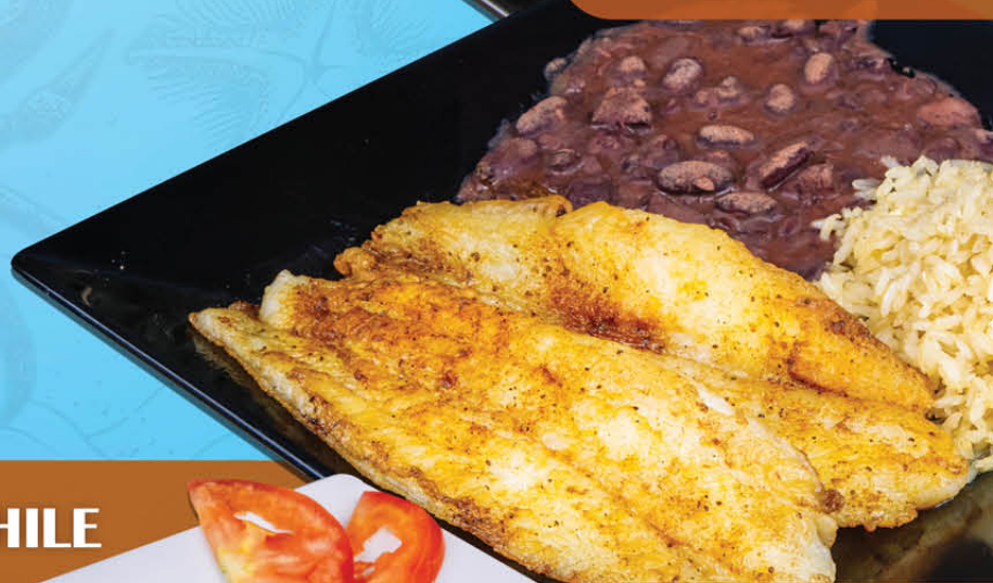
PESCADO A LA PLANCHA