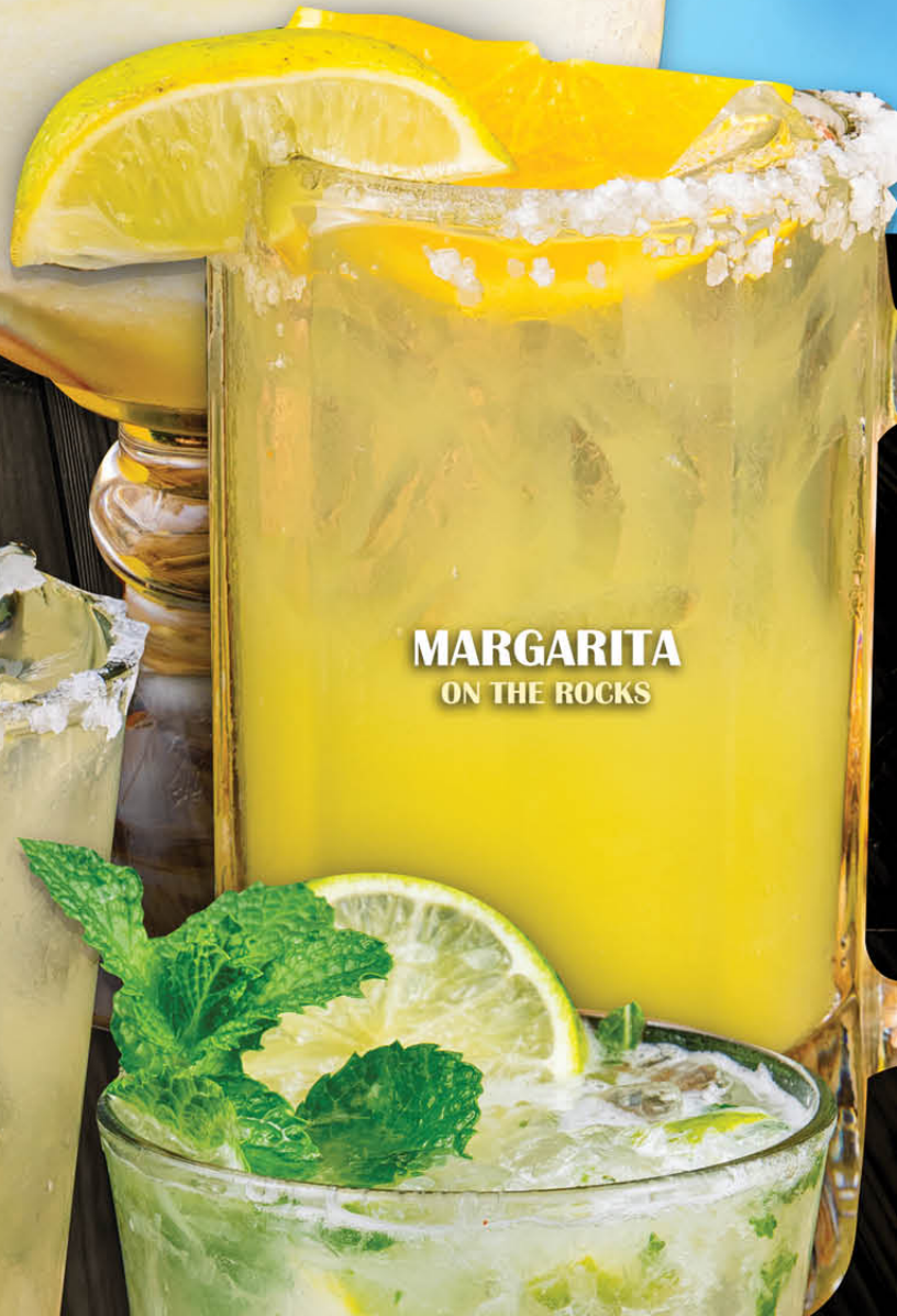
MARGARITA ON THE ROCKS