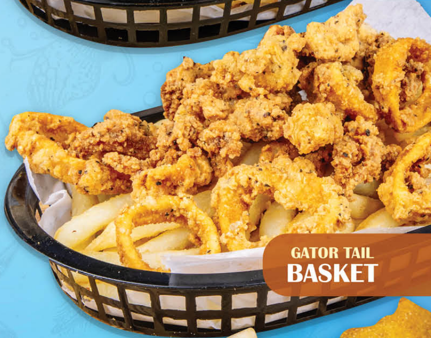
GATOR TAIL BASKET

8 Fresh gulf oysters fried to golden brown. $13.99