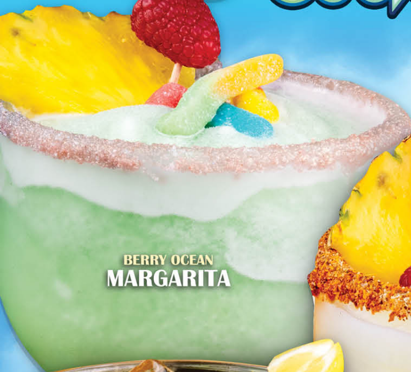
BERRY OCEAN MARGARITA