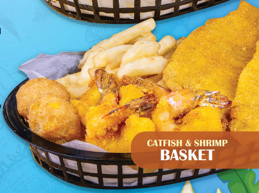
CATFISH & SHRIMP BASKET